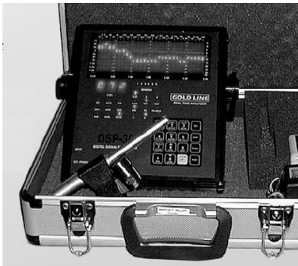
Figure 3. The first STIPA-capable device to reach the market, made by Gold Line (2002).

The 3rd edition introduced two major changes: introduction of the STIPA test signal (two modulation frequencies per octave band, 7 octave bands) and the introduction of level-dependent masking.