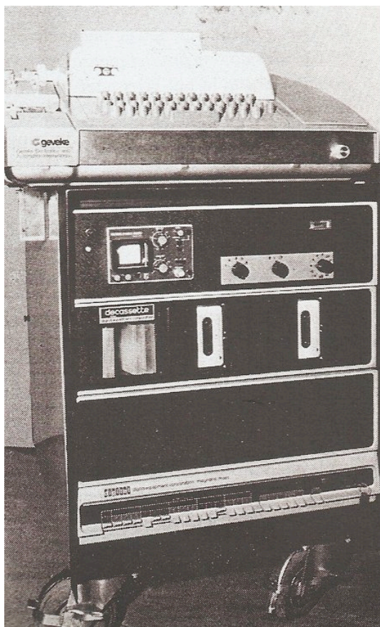
Figure 1. STIDAS I (STI Device using Artificial Signals) device based on a PDP-11/10 computer and custom analog hardware (1971).

The Speech Transmission Index concept also incorporated insights crossed over from research in the visual domain in the early 1970s. Optical system engineers back then already used the concept of the Optical Transfer Function (more generally named the Modulation Transfer Function) to quantify the transmission quality of optical systems. Houtgast and Steeneken realized that similar principles in the time domain should apply to transmission of speech signals.