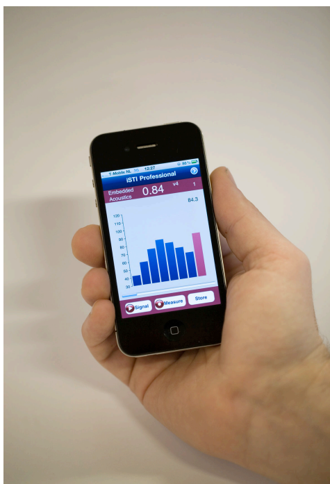
Figure 4. iPhone app for performing 4th edition-compliant STIPA measurements (2011)

The 4th edition features only a single (minor) change to the STI algorithms itself: the calculation of level-dependent masking was changed from a discrete lookup-table to a smooth continuous function. Also added is information on interpretation of the STI relative to true speech intelligibility. Whereas the STI quantifies the impact of the transmission channel on intelligibility, there is also an influence of talkers and listeners. There are fixed and well-known relations between STI and intelligibility for “normal” populations. The 4th edition of the standard also assists in interpreting the STI for populations of non-native talkers and listeners, as well as certain categories of listeners with hearing loss.